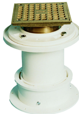
Cast-in Concrete Adjustable Floor Drain With Built-in Firestop Wrap