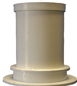
Firestop Closet Stub with Flange