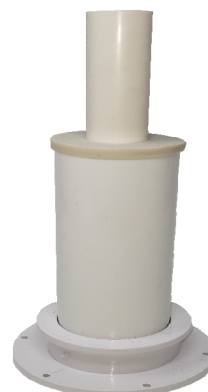
ProSet ProSeal Plugs help make water pipe 3/8" to 1-1/2" Soundproof