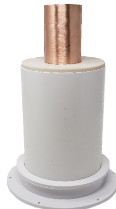
ProSet ProSeal Plugs help make water pipe 2" to 6" Soundproof

All ProSet Sleeve Couplings have Hub openings that can be used to plug-in fabricated piping sections and eliminate pipe hangers for the below piping.