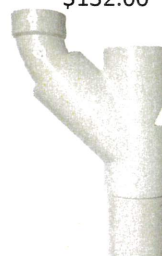
4"X 3" Base PN P4542-B