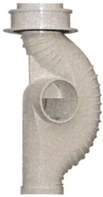
3" Single-Left Hand PN P3542-SL

Fill in the quantities for your order and fax it to: 770-339-1784 or Email to: customerservice@proventsystems.com