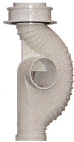
4" Single-Left Hand PN P4542-SL

Male-Male Male-Female Female-Male Female-Female