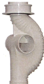
3" Double Stack PN P3542-SD

Male-Male Male-Female Female-Male Female-Female