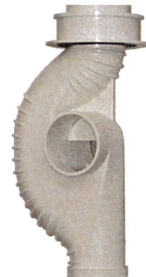
3" Single-Right Hand PN P3542-SR

Male-Male Male-Female Female-Male Female-Female