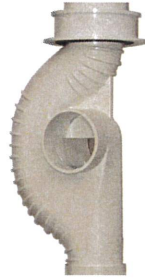
4" Single-Right Hand PN P4542-SR

Male-Male Male-Female Female-Male Female-Female