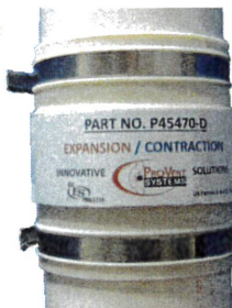
EZ-Mechanical Flex Coupling

2" 3" 4" P25470-D P35470-D P45470-D $11.20 $14.75 $17.60