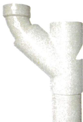
3"X 2" Base PN P3542-B