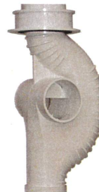
4" Double Stack PN P4542-SD

Male-Male Male-Female Female-Male Female-Female