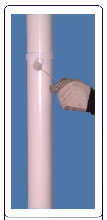
Use a dab of solvent cement to secure Spacer Ring to the pipe