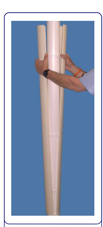
Place both halves of the Shell Pipe around the PVC pipe and rings

Install 2 ProVent PVC Spacer Rings around the existing PVC Pipe