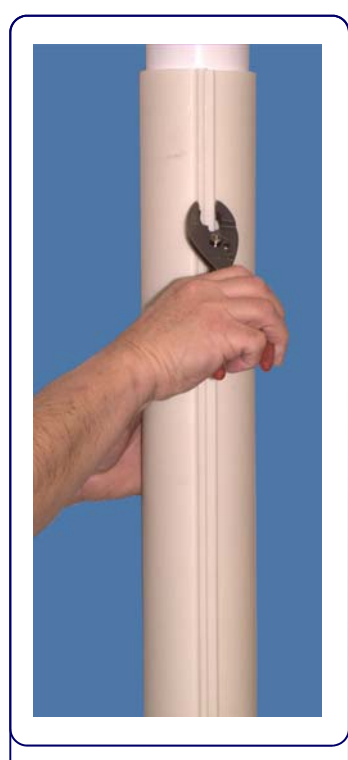
Snap the tongue of one half of the Shell Pipe into the groove of the other